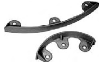
771 P3 Floor Guide