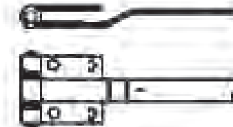
934-B Ball Bearing Jamb Hinge