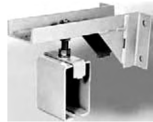
End / Intermediate Bracket